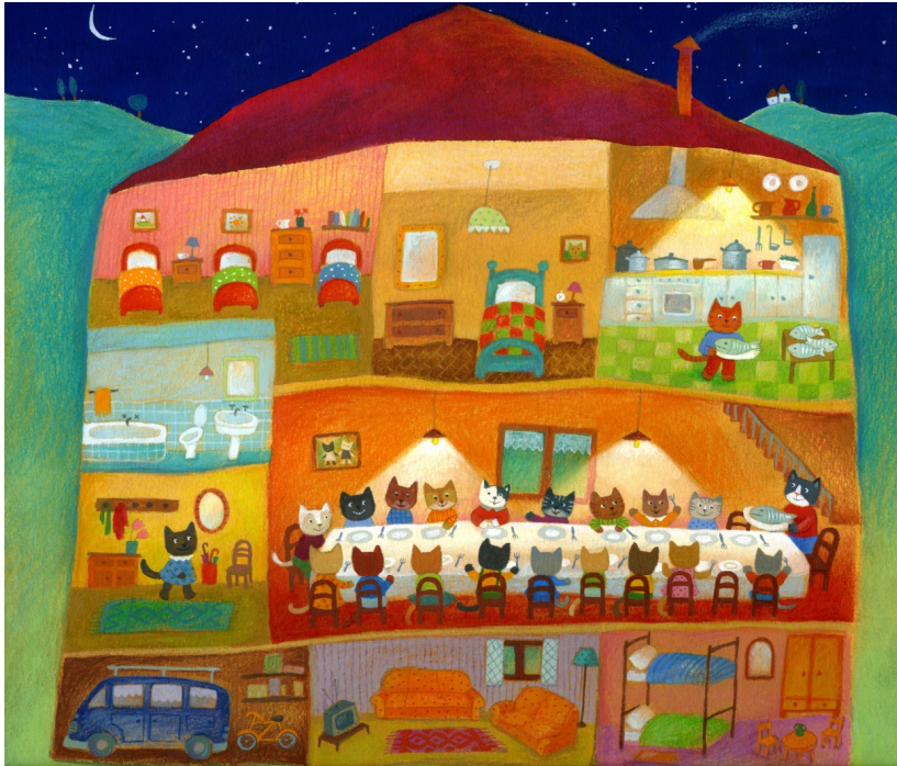
Figure 10. – A very colorful, cheerful and “accessorized” home. Illustration by Antonella Abbatiello, from Antonella Abbatiello (1998).

Marnie Campagnaro – “Narrating” homes and objects: images of domestic life in Italian picturebooks since the mid-20th century