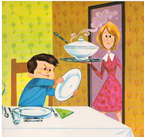
Figure 8. The warm and reassuring presence of a mother in the home. Illustration by Adelina Torelli, from Beniamino Bodini (1971).

(1975), or Armando in Arriva la Pimpa (1975). This presence tends to fade over the next three decades, however, replaced by other symbols of the dimension of warmth and affection in the home.