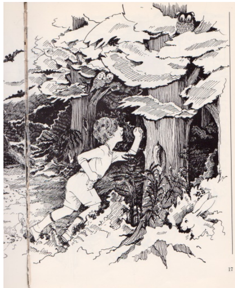
Figure 3. Challenges and adventures on the road home. Illustration by Franca Capalbi from Giovanni Arpino, Franca Capalbi (1983).

From the end of the 1960s onwards, however, there began a remarkable change in how the relationship between inside and outside the home was represented. In the picturebooks analyzed, the protagonists' range of action and the spaces to explore shrank significantly, especially from the geographical standpoint. With the imminent arrival of the 21st century, the characters in the stories gradually change from being explorers of the wider world to travelers in the "domestic cosmos". The setting of their adventures is no longer the planets, the sky, or wild exotic islands far away, but the streets of their own neighborhood, as in the case of Cappuccetto giallo (1972) by Bruno Munari. The protagonists' range of action implodes to reach no further than the garden wall around their home, as in Il viale nero (1983) by Giovanni Arpino (Fig. 3), or the walls of the home itself, as in Due scimmie in cucina (2007) by Giovanna Zoboli and Guido Scarabottolo (Fig. 4). Their adventures play out inside a room, a corridor, or a kitchen.