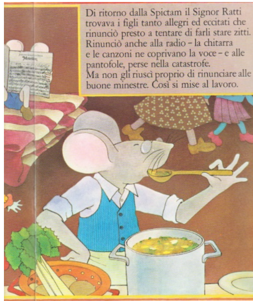
Figure 7. A father “converted” to doing domestic chores in the kitchen for his family. Illustration by Nella Bosnia, from Adela Turin and Nella Bosnia (1975).

With the exception of the two above-mentioned picturebooks, all the other stories develop in more conventional places, those normally shared by the family. They describe kitchens, dining rooms, bedrooms and living rooms that convey a sense of well-being, care and attention to the children’s needs. Such a comforting sense of human warmth comes in some cases from the reassuring presence of an adult at home. This is an important, but not a constant feature. A family member busy cooking (Fig. 7) or laying the table (Fig. 8) was quite common in the picturebooks published in the first 30 years considered (1945-1975). Take, for example, the protagonist’s sister Rosetta in Le straordinarie avventure di Caterina (1942/1959), the mothers in GIP nel televisore (1962) and Il mondo visto da loro (1971), the grandmother in Cappuccetto verde (1972). There were also revolutionary male figures like the father in Una fortunata catastrofe