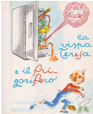
Figure 13. A “narrating” object in children’s literature: the refrigerator. Illustration by Sto (Sergio Tófano), from Sto (Sergio Tófano) (1969).

Over the course of more than 60 years, the refrigerator’s shape (design) changed, and so did the type of food it contained (generally more fruit and vegetables, less meat and fewer sweet things) (Fig. 14), but the symbolic value of the appliance remains intact to this day. So what part does the refrigerator play in these stories? Is it more than just a kitchen appliance? In most cases, a refrigerator bursting with food has a very clear symbolic meaning. It is a visual metaphor of the presence of a good, caring mother: she is attentive, diligent, and capable of offering her children both bodily nourishment (food), and emotional nourishment (love), even when she is not physically present in the home.