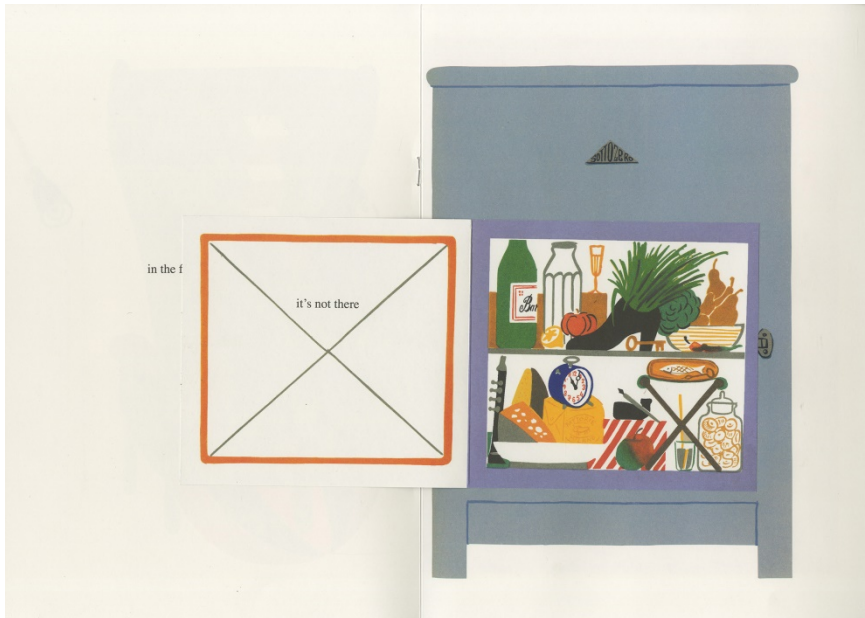
Figure 12. A well-organized ice box? Illustration by Bruno Munari, from Bruno Munari (1945/2004) - © Bruno Munari. All rights reserved to Maurizio Corraini Srl, Mantova.

An electric refrigerator was still a dream for most Italians in the 1950s (only 6% of Italian families had one), but over the course of 20 years it became indispensable for 94% of the Italian population. This meant that in the 1970s Italy was one of the largest manufacturers of refrigerators in the world, together with the USA (Faravelli Giacobone, Guidi & Pansera, 1989). The central role of this particular appliance also emerges from many of the picturebooks analyzed. It often takes pride of place in the kitchen, with its door open and its shelves bursting with food. The illustrators often dedicate whole pages to it (Fig. 13).