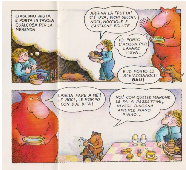
Figure 15. A “narrating” object of children’s literature: the table. Illustration by Cristina Lastrego, Francesco Testa, from Cristina Lastrego, Francesco Testa (1989).

importantly, it registers the emotional and affective temperature of family life, even revealing complicities and relational difficulties.