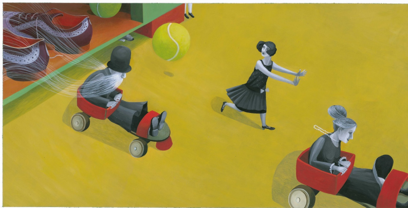
Figure 5. An unconventional, “divergent” image of childhood. Illustration by Maja Celija, from Maja Celija (2006).

But in many children's stories, the night is also when parents, and adults in general, sleep, loosening (or are unable to maintain) their control over the children, and the latter's thoughts and actions. In this limited space of time, childhood enjoys the freedom to experiment and, if necessary, to break the adults' rules. The characters in modern-day picturebooks seem to make little use of their domestic environment during the night. They tend to move around and take action almost exclusively in the light of day, in rooms that are well-lit and safer, less insidious, transgressive or destabilizing than in the past. What emerges, in most of the stories at least, is a picture of childhood that, though still not fully shaped, tends not to be subversive. Among the stories considered, there were certainly some tales of protagonists breaking the rules (especially when the adults were elsewhere), and offering a more rebellious and diverging image of childhood - as in Gigi cerca il suo berretto (1945), Piazza pulita (1968), Una fortunata catastrofe (1975), Rosabianca (1985), La casa impossibile (1991) and Chiuso per ferie (2006) (Fig. 5). Nonetheless, with a few rare exceptions, everything tended to return to normal in the end, presenting a picture of a restored harmony, family balance, security, and serenity.