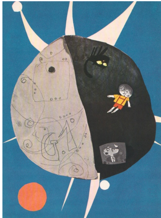
Figure 2. Gip, the “cosmic child” who journeys in space. Illustration by Giancarlo Carloni, from Gianni Rodari, Giancarlo Carloni (1962).

Another unusual, bizarre, tongue-in-cheek journey is the one made by Gip in the story in orbit GIP nel televisore (1962) by Gianni Rodari. The young protagonist explores countries and regions of the world using a household appliance: the television. From his living room at home, Gip is “teletransported” to Egypt, Finland, Yugoslavia, Morocco, Holland, Sweden, and even into orbit, in the cosmic space around the Earth 6 . During his adventurous travels, Gip does not just circumnavigate the Earth, he even goes beyond the confines of our planet (Fig. 2). In this delightful story, the little boy from Milan journeys from one adventure to the next, all over the world and beyond, becoming a genuine “cosmic child” (Rodari, 1962, p.52).