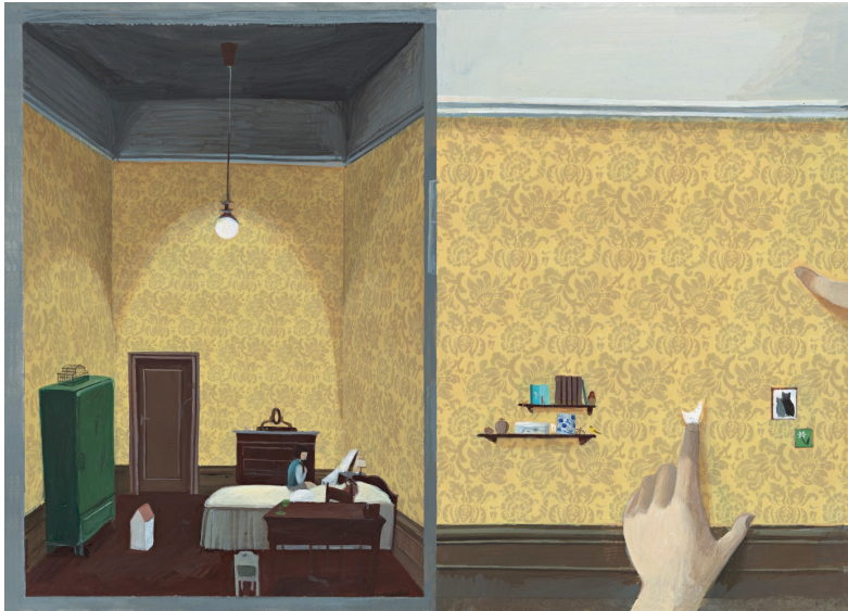
Figure 17. Using the imagination to escape from domestic isolation. Illustration by Mara Cerri, from Mara Cerri (2009).

The third aspect concerns the growing importance of representing household objects. Starting from the 1960s, the picturebooks analyzed reveal a pervasive presence of objects that are no longer merely for decorative purposes. They are used more and more as vital indicators of the warmth of life at home, the quality of the affections and family relationships. They become genuine “narrating objects”. There are vases of flowers, attractive wallpaper, curtains and tableware, bread baskets, water jugs, fruit bowls, steaming soups, bubbling pans, fridges full of food. All the household appliances and lights are switched on. Together, these objects generate a narrative movement. They take part in the construction of the scenic action, and they play an active part in relation to the protagonists, as explained earlier (by way of example) in the case of refrigerators and tables. Starting from the 1980s, the emotions narrated in the picturebooks become increasingly rich and multifaceted. This is probably partly because children's literature